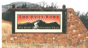
Duty Rowe Fit Kids Fitness Trail Way System and proposed signage

Roxanne Turley Natural Resource Planner US Fish and Wildlife Service, Region 2 500 gold Ave. SW Albuquerque, NM 87102 Phone: (505) 248-6636 Email: Roxanne_turley@fws.gov